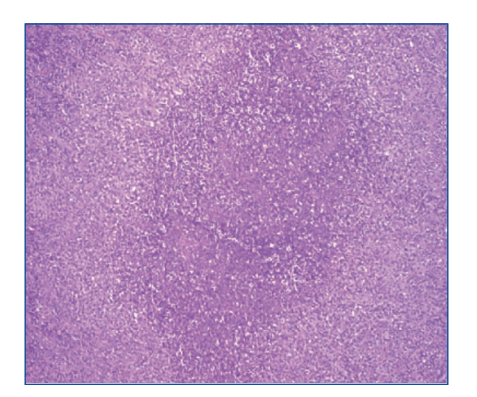
Figure 2. Ganglion biopsy – Focus of stellate aspect necrosis with epithelioid macrophages in the periphery (H&E, original magnification x100).

virus, herpes virus, cytomegalovirus, toxoplasmosis, brucella, leishmania, and HIV infection were negative. Blood culture was sterile. Chest and abdominal CT scan without changes. Quantiferon test for tuberculosis was indeterminate. Peripheral blood cytometry and cytometry of ganglion did not showed immunophenotypic alterations compatible with lymphoma. An ganglion biopsy was performed and histological examination revealed reactive lymphadenitis with central necrosis (Ziehl neelsen was negative) alterations compatible with CSD (Figures 1 and 2). She stopped the initial antibiotherapy on the 6th of