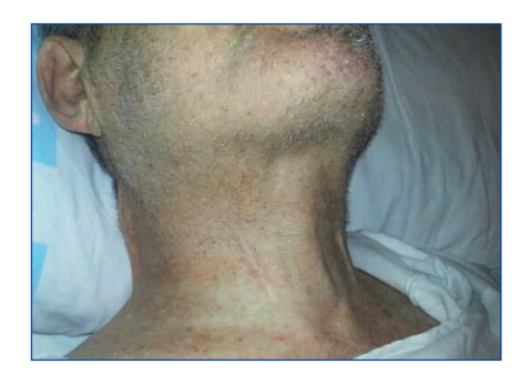
Figure 1. Swelling of the right parotid and right submandibular gland.

Iodide mumps are characterised by a rapid and painless growth of the salivary glands following iodine contrast administration. It can present itself several minutes after exposure and up to 5 days later. Its incidence is unknown, with few reported cases: 40 until 2012.<sup>2</sup> It was described for the first time in 1956 by Sussman and Miller.<sup>3</sup> It is believed to be caused by iodine contrast, as an idiosyncratic reaction or due to its toxic accumulation which