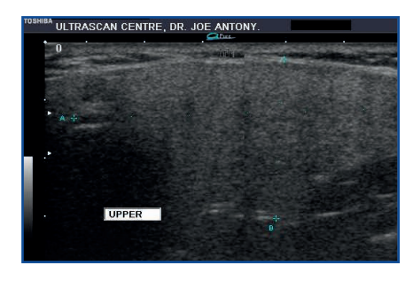
Figure 2. Ecography of normal parotid gland.

causes inflammation, oedema of mucous membranes and duct obstruction due to the concentration through the sodium iodide symporter of salivary gland tissue. 98% of iodine is excreted by the kidney and the remaining 2% by the salivary, sweat and lacrimal glands. As a result, CKD could be a risk factor for its development.<sup>4</sup> It can recur with successive exposures to iodine contrast.