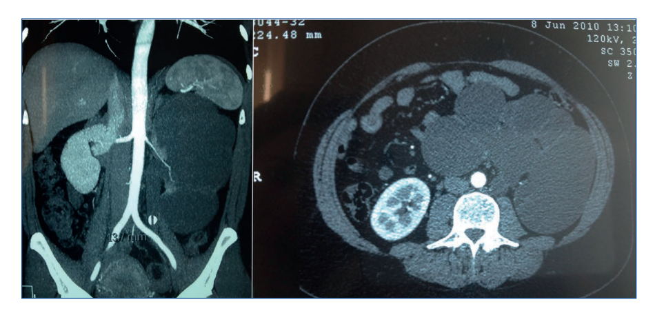
Figure 1. CT Angiogram.

Left kidney 22 cm. Late-stage ureterohydronephrosis with no evidence of kidney parenchyma, crossing the midline and causing traction that evidently reduced the diameter of the left renal artery (79-80%). Lithiasis of 1-2 cm at the L4-L5 level. Normal right kidney and renal artery.