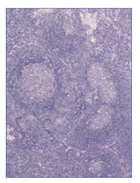
Figure 2. Adenopathic mass with heterogeneous lymphoid follicular hyperplasia and preserved structure. H-E 20x.

In this case, the histopathological diagnosis was plasma cell-type Castleman's disease. We also identified amyloid deposits in the perivascular region, the paracortex, and the submucosa of the small intestine.