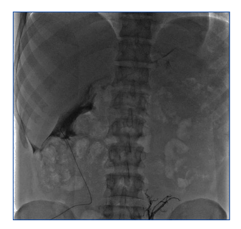
Figure 2. Peritoneography. The dye is encapsulated and contained between the intestine and lower edge of the liver, trapped by a large volume of faeces with residual lanthanum chelating agent.

not resolve the poor positioning of the catheter, which had to be relocated.