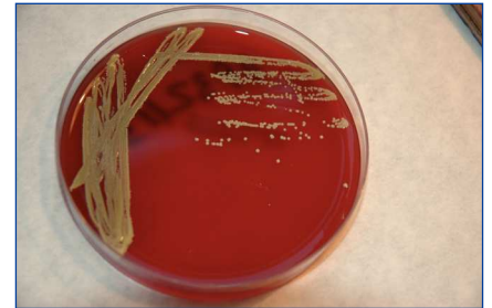
Figure 1. Oerskovia culture on a blood agar plate

The peritoneal fluids were collected in aerobic and anaerobic bottles for BacT/Alert blood culture test (bioMérieux, Durham, NC, USA). Both bottles were found to be positive at between 23 and 24 hours, and the gram staining revealed branching gram-positive bacilli. Chocolate agar, blood agar, and colistin-nalidixic acid