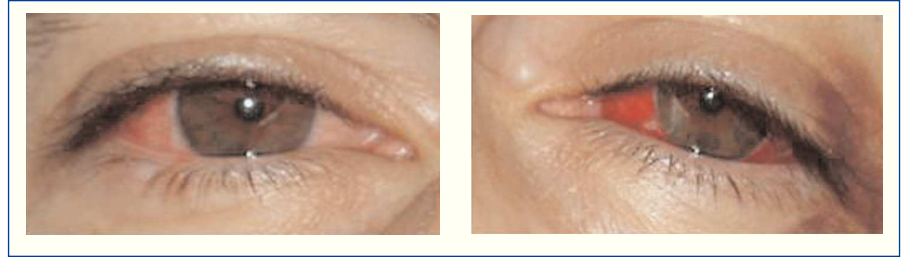
Figure 1. Subconjunctival bleeding due to diffuse episcleritis.

Here we present a case of a 44 year old male patient complained of asthenia for one month. Two weeks before he developed bilateral subconjunctival hemorrhage without photophobia or ocular pain. The patient denied epistaxis, hemoptysis, abdominal pain, arthralgias or myalgias. On examination he had subconjunctival bleeding due to bilateral diffuse episcleritis (Figure 1). There were no cardiopulmonary auscultatory findings, no purpura and no signs of arthritis. The patient past medical history was remarkable for chronic sinusitis with frequent episodes of epistaxis. The blood panel showed severe azotemia (serum creatinine 11,2 mg/dl, BUN 100 mg/dl), normocytic normochromic anaemia (Hb 11,3 g/dl; Ht 33,3%), C-reactive protein 16,9 mg/L (0-10 mg/L), active urinary sediment (30 red blood cells per high-power field, 4 red blood cell casts), and a 24 hour proteinuria of