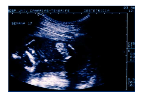
Figure 2. A similar situation early in the second trimester

This is an early clinical presentation of cystinuria, reflecting the high lithogenic capacity of this condition. The particularity of the case is that ultrasound the prenatal found hyperechogenicity of the colon secondary to cystine crystal deposition. This form of presentation of cystinuria was described in 2006<sup>3</sup> and was subsequently confirmed.<sup>4</sup> The explanation for this finding is that the cystine crystals are formed in the foetal kidney, they enter the amniotic fluid and are then swallowed. The ultrasound finding of the foetal hyperechogenic colon has been traditionally related to cystic fibrosis,