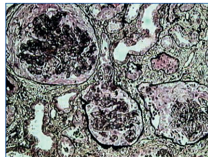
Figure 1. Medium-power view showing cellular crescents in all the glomeruli (Silver stain, ×200).

To our knowledge, this is the first case of IgMN in literature presenting with full-blown CresGN. The latter