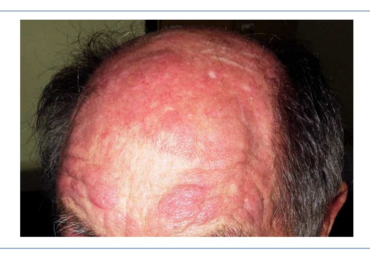
Figure 2. Psoriasiform scalp.

abnormal electromyography, and (v) abnormal findings on muscle biopsy.5 In our patient, all criteria were fulfilled to diagnose dermatomyositis. Regarding the classification scheme proposed by the 119th European Neuromuscular Centre international workshop,6 our patient falls in the probable dermatomyositis category by not fulfilling the perifascicular atrophy criterion on muscle biopsy. Classic histological findings, especially identification of mononuclear cellular infiltrates, remain the basis of the diagnosis, however these can be absent even in the presence of disease. MHC class I expression on the sarcolemma has been proven to be upregulated in IMM and is a valid test for the diagnosis of these myopathies since they are not affected by potential sampling errors.7 Common myositis-specific autoantibodies present with a frequency ranging from 1-30% and were negative in this case, but are not required for definitive diagnosis of inflammatory myopathies. There is an increased risk for malignancies,5 and age-appropriate cancer screening tests should be performed. Major therapeutic aims include elimination of muscle inflammation, restoration of muscle strength and prevention of chronic muscle disease in order to reduce morbidity and improve quality of life.5 Immunosuppressive therapy entails corticosteroids at a dose of 1mg/ kg/day.5,8 administration Concurrent azathioprine methotrexate, mycophenolate mofetil may be started,5