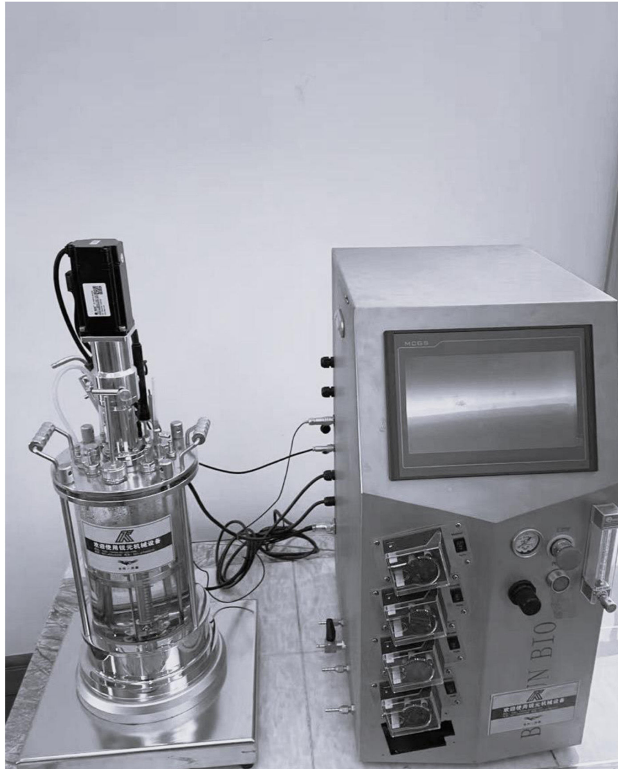
Fig. 1 – Experimental equipment for struvite crystallization.