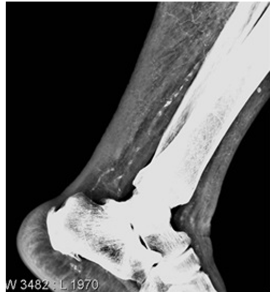
Fig. 4 – Simple X-ray of left ankle.

This case urges us to consider iron overload as a possible factor in the development of skin ulcers in patients with CKD administered IV iron, both for its known pathogenic role in producing tissue damage and its possible association with other diseases, such as calciphylaxis. It is also a warning to