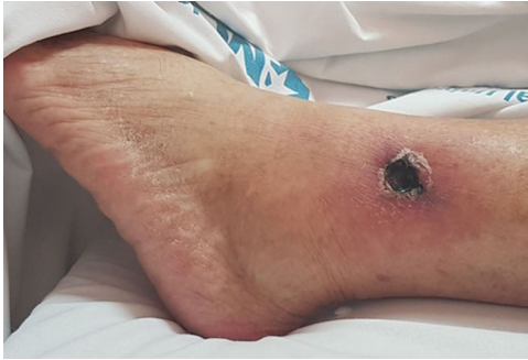
Fig. 2 – Ulcer on left ankle.