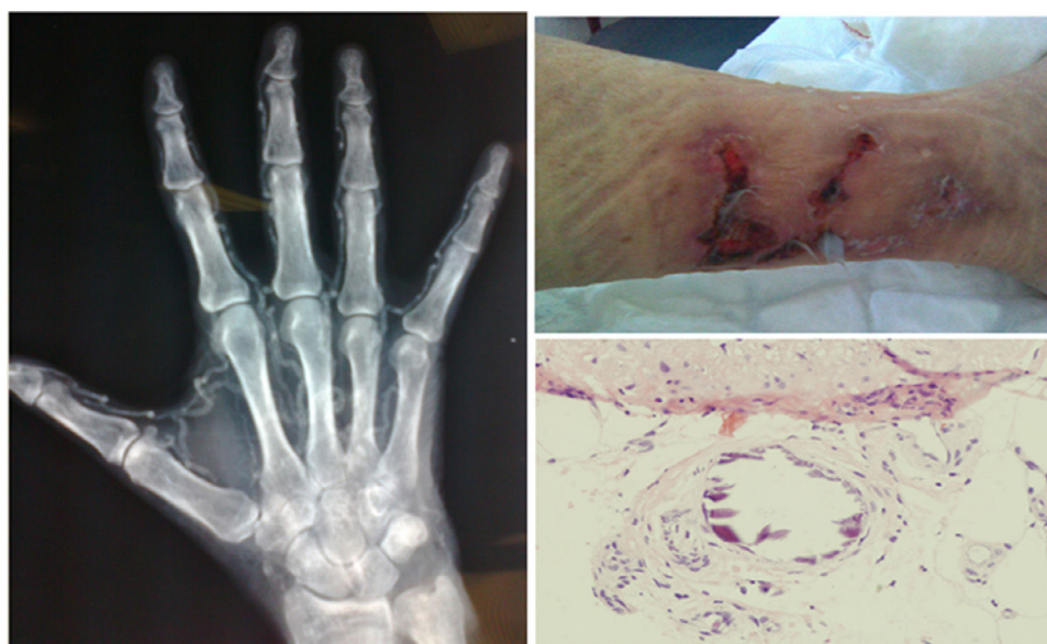
Figure 2 – Skin lesion on lower limb caused by calciphylaxis (top right). Histological lesions in the subcutaneous cellular tissue with areas of calcification, some of them perivascular, consistent with calciphylaxis (bottom right). X-ray of left-hand showing vascular calcifications (left).