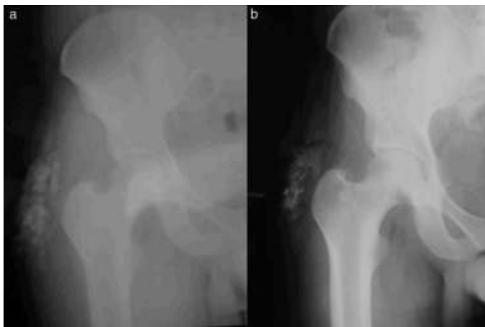
Fig. 2 – Comparative radiographic imaging of a patient with TC after 7 years of acetazolamide treatment: (a) Start of treatment (August 2008). (b) Follow-up (February 2015).

main causes of patient symptoms. 3 This disease is more frequent in women and in patients of African origin, with initial presentation in childhood or early adolescence. 2