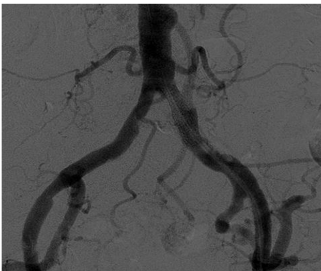
Fig. 2 – Recuperation of the vascular calibre after stent placement.

Despite the fact that Doppler ultrasound, repeated on 2 occasions, did not suggest stenosis of the renal artery, we decided to perform an angiography. The study detected obliteration of the distal portion of the left common iliac artery (Fig. 1), with permeability of the rest of the iliac axis and of the artery of the renal graft. After pre-dilatation, a stent was inserted in the area of the obliteration, with almost complete recovery of the vascular calibre (Fig. 2).