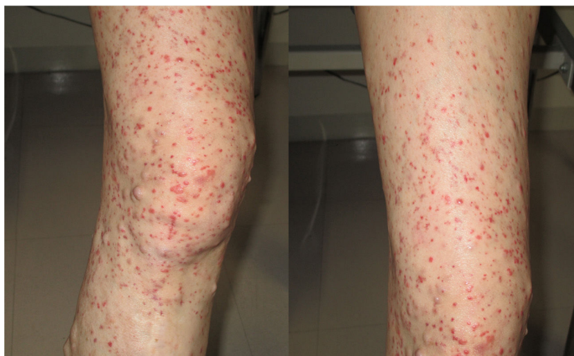
Fig. 1 – Physical examination showed neurofibromas and palpable purpura on the right leg.