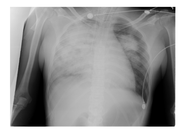
Fig. 1 – Chest X-ray revealing bilateral diffuse opacity, predominantly in the right hemithorax.

The initial presentation led us to consider an immunological cause for the pulmonary renal syndrome, despite the