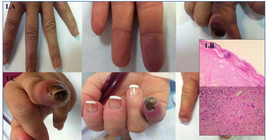
Figure 1. Macro and microscopic images of lesions.

In June 2011, the patient developed similar but milder symptoms in the third finger of the right hand, this time coinciding with a haemoglobin value of 15g/dl. The patient was bled and started on alprostadil, which effectively treated the ischaemia. A Doppler ultrasound revealed marked spectral wave damping in the cubital, radial, and