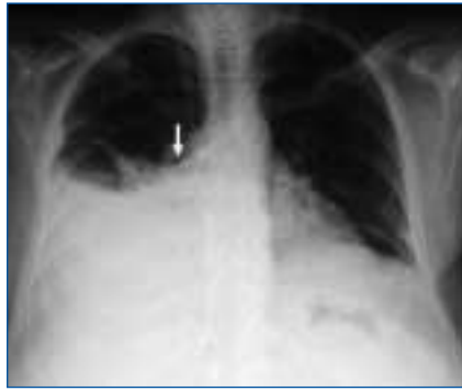
Figure 1. Chest X-ray showing right pleural effusion due to impaction of the left jugular catheter within the pleural space.

The patient came 29 days later to hemodialysis referring dyspnea and pain in on her right scapula. At the beginning of the session clear fluid was obtained through the arterial branch and hematic fluid through the venous branch. A chest X-ray film was made (fig. 1), which showed right pleural effusion. Dialysis was performed without heparin through a right femoral access. Fifteen minutes after the end of hemodialysis the patient referred sudden right chest pain and dyspnea and she suffered cardiopulmonary arrest. On physical exam right pulmonary hypoventilation was evident. A decrease of hemoglobin value was detected on blood analysis, and the right pulmonary field was opaque on chest X-ray. The diagnosis of massive hemothorax was suspected, a drain tube was placed and resuscitation maneuvers were initiated. The patient was referred to the ICU, where she spent 72 hours and after that