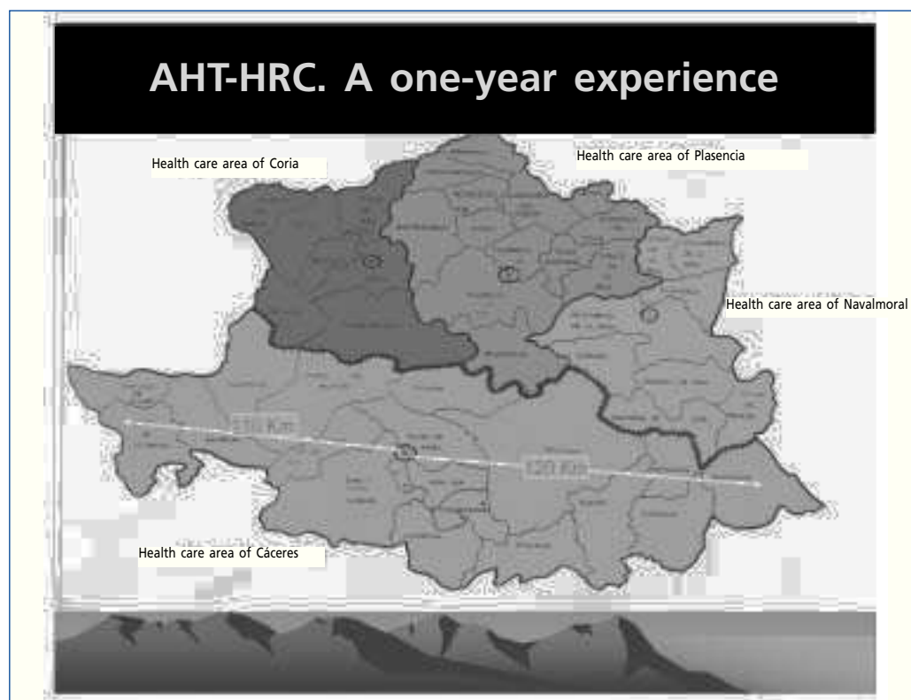
Figure 1. Health care map of the province of Cáceres and its health care area.