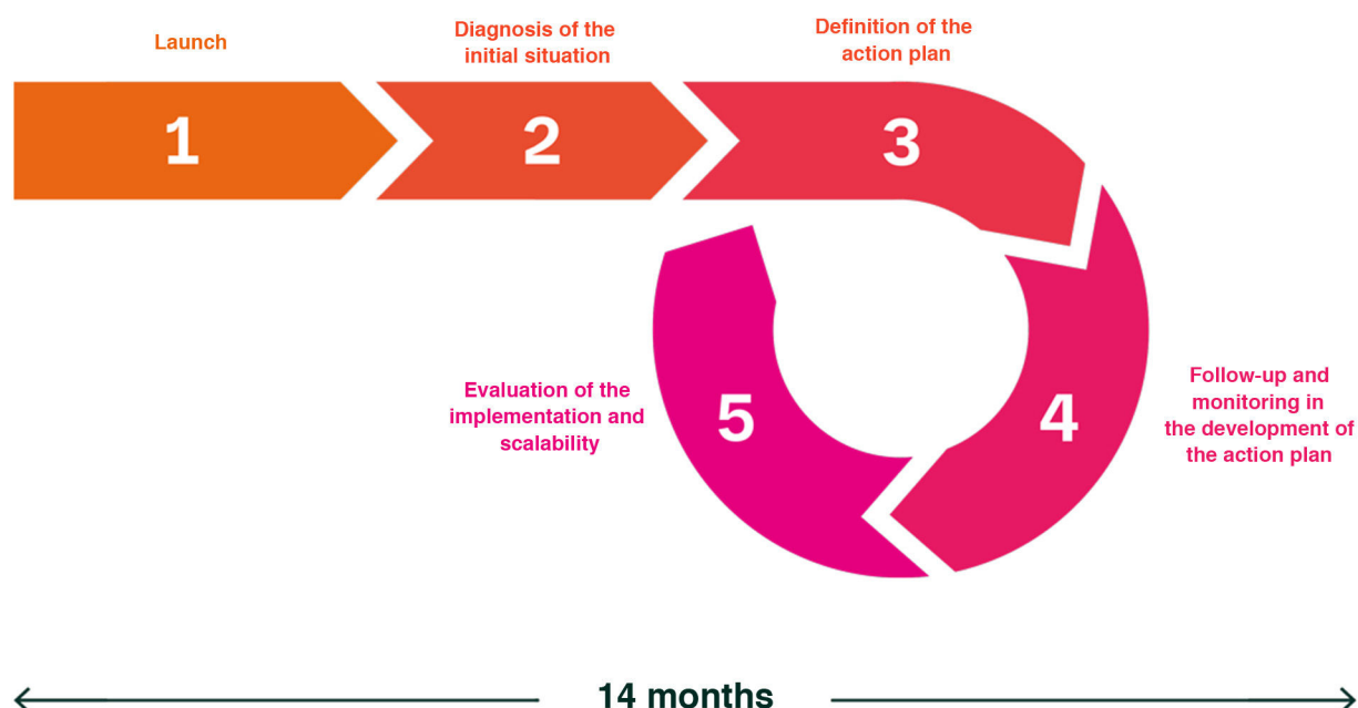
Fig. 4 – Development phases of the InterERKit implementation model.

(ICMJE). All authors have contributed significantly to the work presented in this article, contributing in the conception, design or acquisition of information, or in the analysis and interpretation of data. All authors have participated in the drafting and/or revision of the manuscript and agree to its publication.