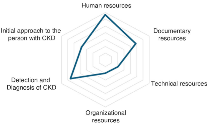
Fig. 2 – Illustrative example of results from the IntERKit self-diagnosis questionnaire.