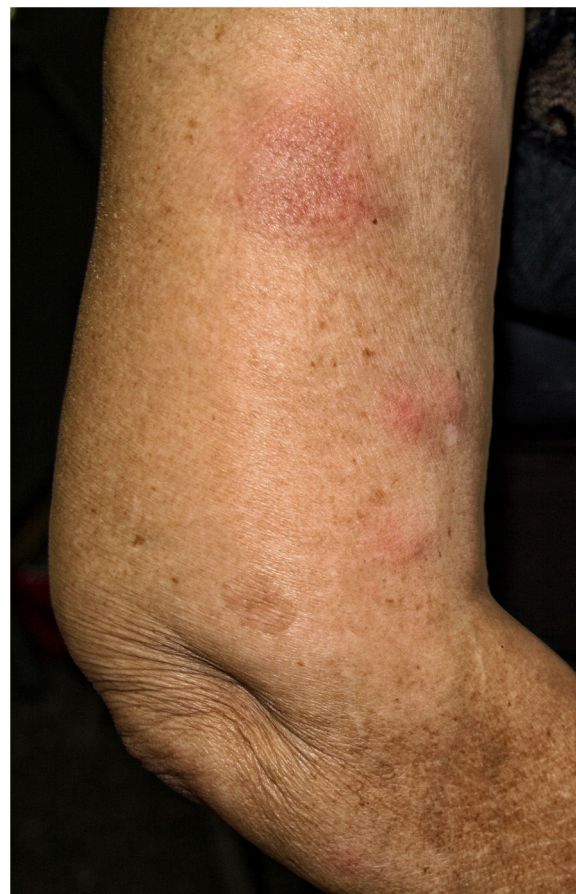
Fig. 1 – Erythematous and painful nodules on pressure located on the arms.

Different forms of vaccine-associated vasculitis have been described (Kawasaki disease, 4 P-ANCA and C-ANCA positive 5 ), but in the case of VIV the predominant form is cutaneous vasculitis, 3 affecting mainly the elderly and women, conditions that were present in the patient described above. However, in most of the cases described, the causal relationship between immunization and VL has not been demonstrated. 1,6