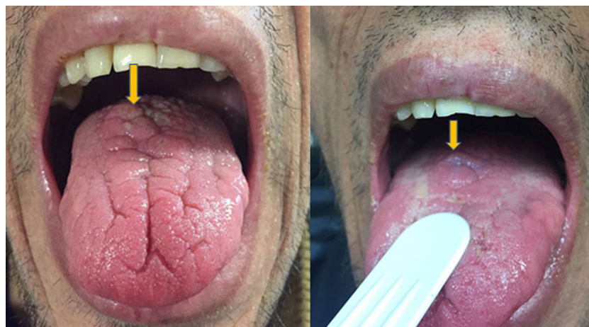
Fig. 1 – Lesion on the back of the tongue.