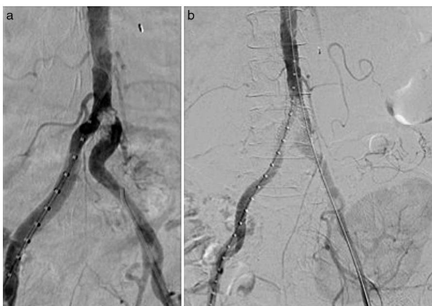
Fig. 2 – Intraoperative arteriography. (a) A calcified intraluminal lesion was observed at the origin of the left common iliac artery. (b) Post-implantation control of the coated stents without residual stenosis.

The COBEST study 9 is the only prospective, randomized, multicenter trial comparing the use of coated stent versus the free stent in iliac occlusive disease. Their results have shown