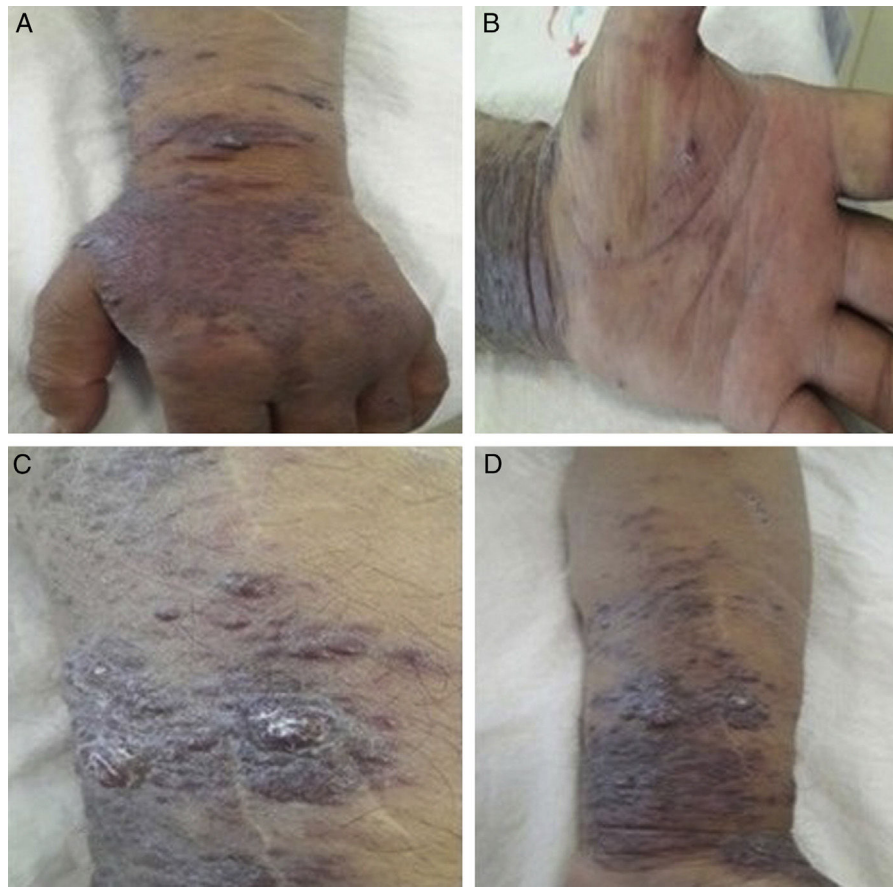
Figure 1 – Multiple discrete, (nonulcerated, erythematous-violaceous nodules and plaques on left forearm and hand(A,B,C,D).