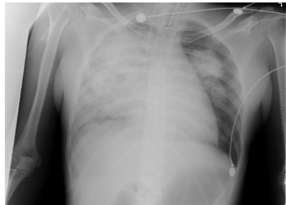
Fig. 1 – Chest X-ray revealing bilateral diffuse opacity, predominantly in the right hemithorax.

The initial presentation led us to consider an immunological cause for the pulmonary renal syndrome, despite the negative immunological results, which might occur in 10–20% of the PRS of immunological origin. The unexpected nodular glomerulosclerosis on the kidney biopsy led us to further investigate an hematological disease, because together with diabetes mellitus and smoking, light or heavy chain deposits