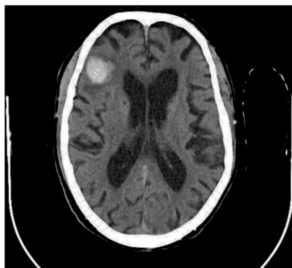
Fig. 1 – Non-contrast head CT along hospitalization (September 2015).

the management of concomitant pathologies with antithrombotic therapy requirement. This is particularly important in patients under hemodialysis, who need anticoagulation treatment during sessions. In regard to antiplatelet treatment, retrospective researches show different outcomes respecting bleeding risk, 8 although acetylsalicylic acid is generally avoided and replaced by clopidogrel. Anticoagulation with heparin is also controversial. On the one hand, a case report of CAA-related inflammation treated with enoxaparin 4000 IU/12 h due to venous thrombosis, described a subsequent big cerebral hematoma which caused death. 9 On the other hand, low-molecular-weight heparin (LMWH) is recommended despite cerebral hemorrhage if immobilization extends beyond 3-4 days. 10 In the exposed case of