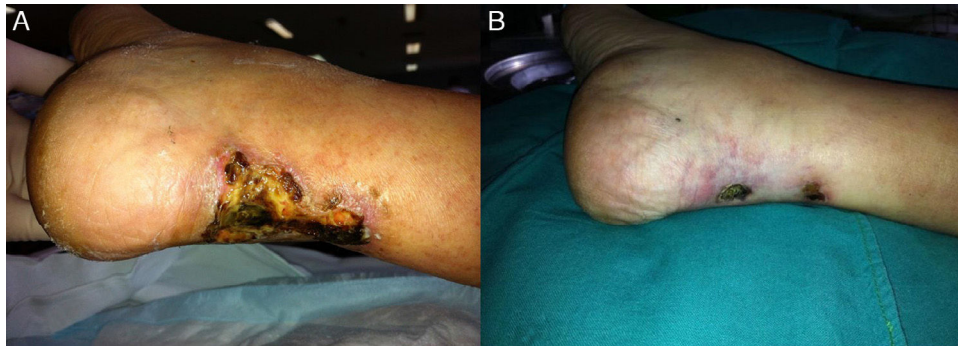
Fig. 1 – Healing of calciphylaxis lesions after parathyroidectomy. At the beginning (A) and after 2 months (B) of treatment with ST.