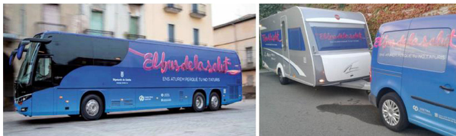
Fig. 1 – Exterior design of the mobile unit (bus and caravan).