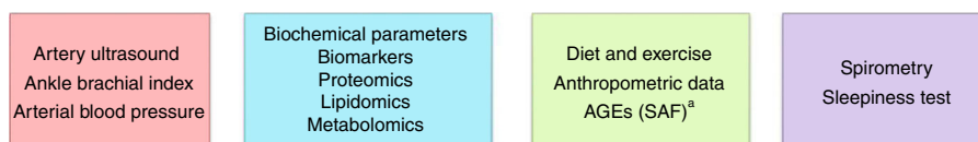
Fig. 2 – Diagnostic tests in the mobile unit. a The diagnostic test used to measure AGEs is skin autofluorescence. AGE: advanced glycation end product; SAF: skin autofluorescence.