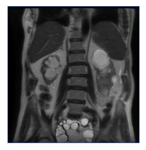
Figure 1. MRI Pelvic hydatid cyst and secondary bilateral hydronephrosis are observed.

cyst operation, haematogenous seeding occurred following rupture, with the formation of a pelvic cyst, which quietly grew over the years.